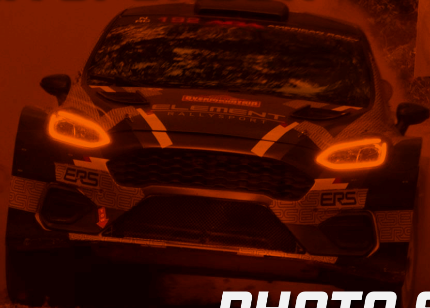
PHOTO & VIDEO PACKAGES